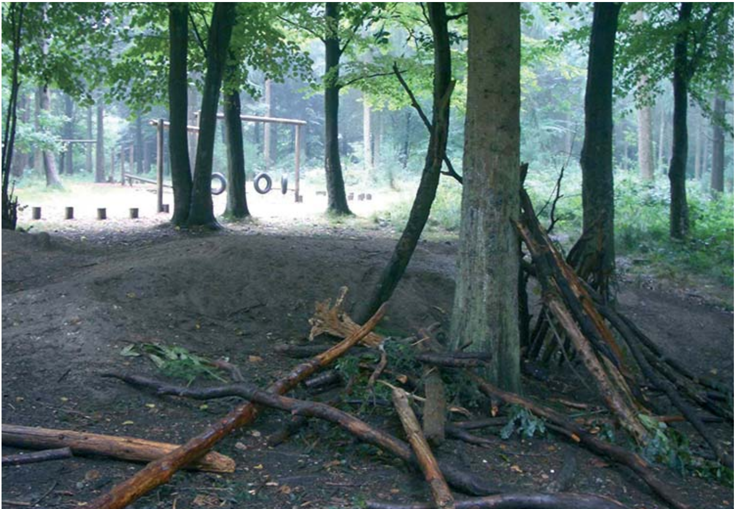
Table 1 overleaf gives guidance for assessing and managing risks associated with dens and tree houses.