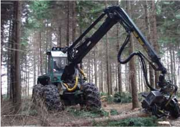
Where our sites are planted with non-native conifers, we gradually convert these to predominantly native woodland

Parts of our estate consists of non-native conifer or mixed plantations that have been established on previously open land such as arable or improved grassland sites. We gradually change these woods to predominately native woodland, while respecting local landscape or cultural aspects such as the retention of significant non-native trees.