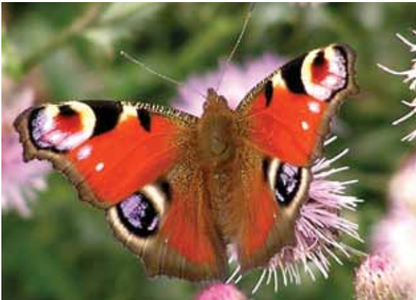
Sheltered and sunny woodland glades and rides can be important for butterflies, attracted to flowering plants once more widespread in the countryside.

The open ground represented by woodland rides and glades in woods are an important habitat supporting a diverse range of wildlife. They are often vital for species which at one time were found more frequently in the wider countryside when unimproved grassland and shrub habitats were more common. They also provide a focus for visitors to enjoy the associated wildflowers, butterflies and bats. We aim to restore and maintain existing rides and glades and, where appropriate, create new ones to enhance biodiversity and enjoyment for visitors.