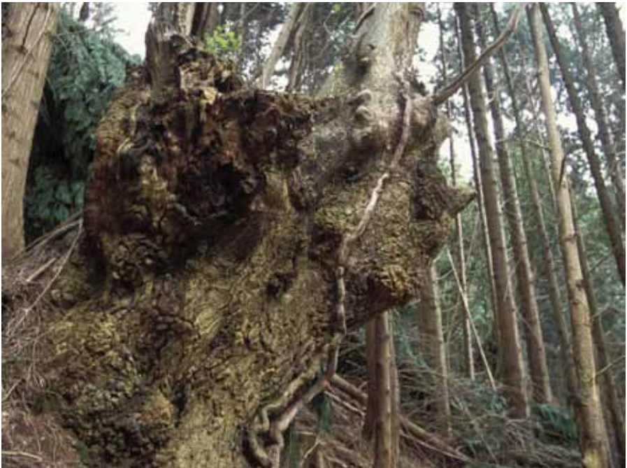
We have mapped all the ancient trees on our estate and undertake management to safeguard them and the wildlife they support

One of the key values of ancient trees is the amount and variety of deadwood that they provide which is in turn an important resource for rare fungi and insects. While seeking to minimise the risk to visitors we promote and retain as much deadwood habitat as possible in our woods for the biodiversity benefits it provides.