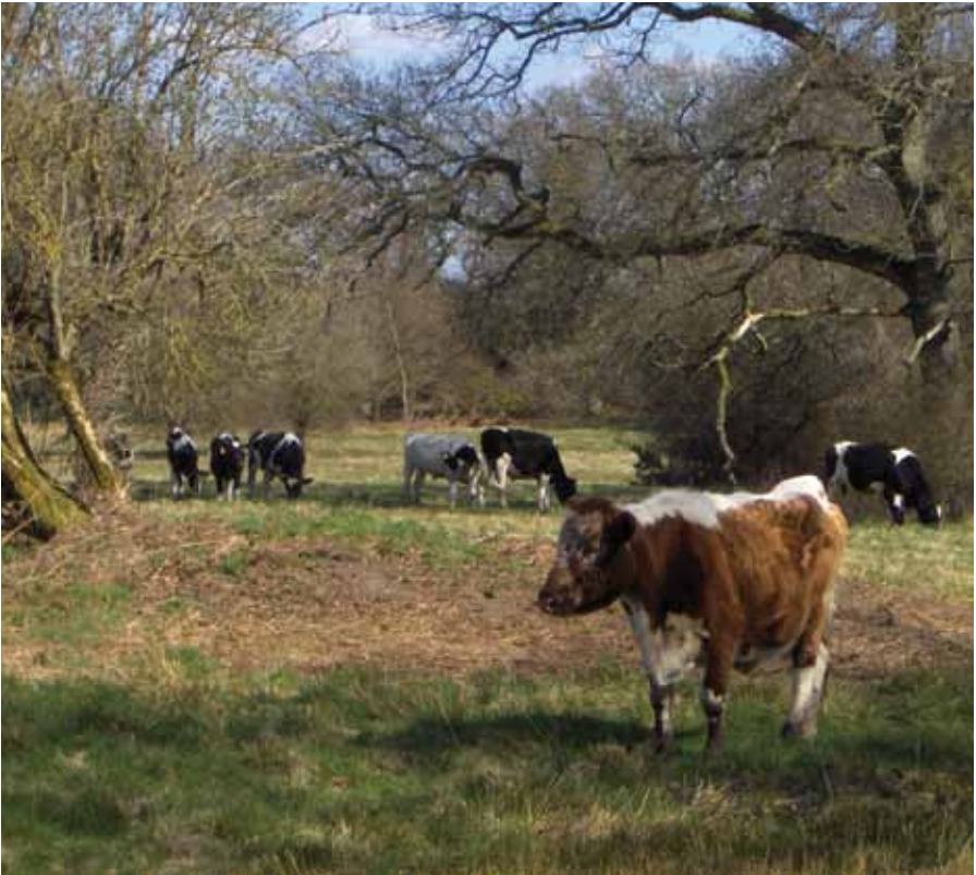
Grazing cattle can be an important management tool to maintain valuable open ground habitats.

Where semi-natural open ground habitats have been encroached or planted with woodland, we restore them to open ground where it is practical and can be sustained.