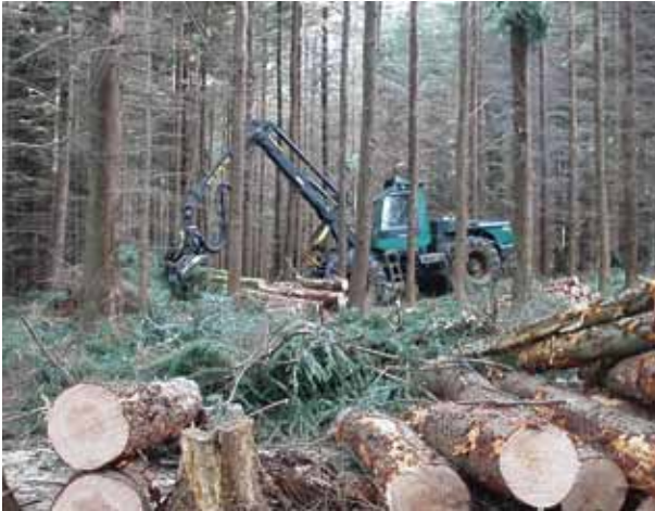
The gradual removal of conifers from PAWS woodland allows remnant ancient woodland communities to recover.

Plantations on ancient woodland sites are ancient woods that have been planted with non-native species mostly during the 20th century. However non-native conifer plantations can have a negative impact on the ecology of ancient woods, through the management to establish them and then the impacts of the dense shade they cast. Such sites can lose much of their ancient woodland flora and fauna. However research has shown that in most PAWS site