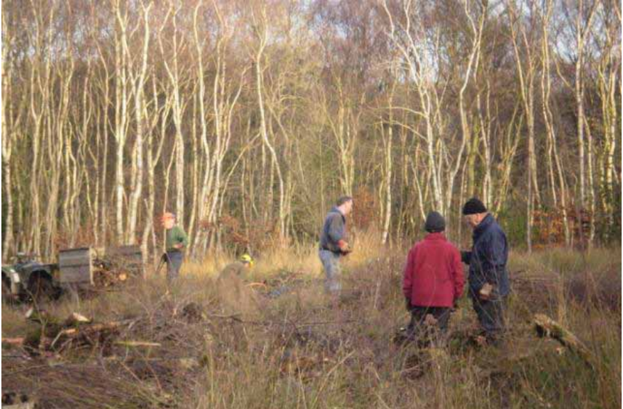
Volunteers are an integral part of the Woodland Trust and make an enormous contribution to woodland conservation

We recognise the value of local people and organisations taking a greater stake in the management of our woods. We are therefore open to transferring sites into their care where they can continue to provide the wider local benefits provided by those sites.