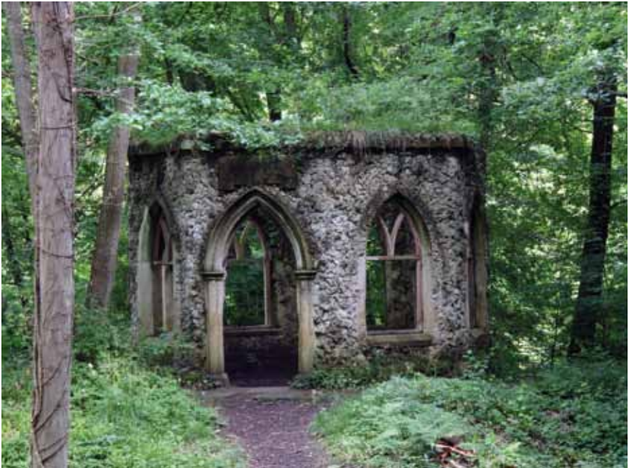
Woods often contain important archaeological features.

We aim to protect these features and, where appropriate provide interpretation which can add to the experience of the woodland for visitors. Management may involve the removal of trees in order to help preserve below ground archaeological interest or reveal the feature more fully, such as ancient hill forts, or nationally important structures such as Offa's dyke. Very occasionally it involves major works to conserve buildings such as ice-houses, follies and historical crofts.