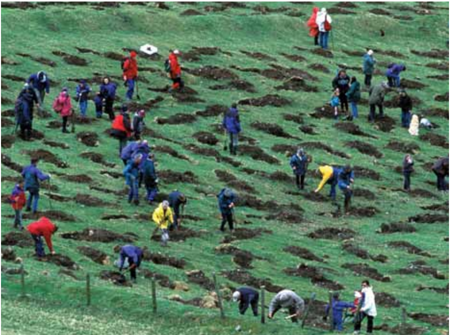
Woodland creation creates an opportunity for people of all ages to get involved in tree planting and to play a part in their local environment.

We do not create woodland on valuable semi-natural habitats, such as unimproved grassland. Where appropriate we will create other habitats, such as wetlands and ponds, to reflect the local landscape and increase the opportunities for wildlife.